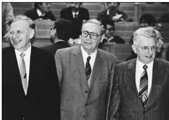
Grauert, Stein, and Remmert, 1990.

In [G5] Hans Grauert found the remarkable link between pseudoconvexity and contractibility of divisors. His criterion for contractibility, expressed in terms of negative definite matrices, has become one of the important theorems