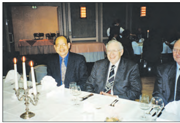
Grauert and Siu, 2000. Seventieth birthday in Göttingen.

As an offshoot of his solution of the Levi problem by his bumping technique, Grauert observed that the total space of a negative line bundle over a compact complex space is strictly pseudoconvex. With this observation Grauert established a link between his bumping technique of constructing holomorphic functions and the vanishing and embedding theorems of Kodaira in algebraic geometry, thereby extending the latter to the setting of singular spaces. Such a connection also led to the development of his important theory of modifications and exceptional analytic sets.