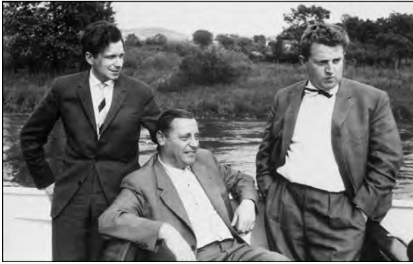
Grauert, Stein, and Remmert, 1957. Three men in a boat at the Arbeitstagung.

Three fundamental research monographs were jointly published with Remmert, and with various coauthors he published textbooks in the areas of real and complex analysis.