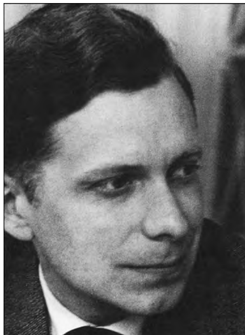
Hans Grauert, 1960.

speaker at the ICM in 1958, 1962 (plenary lecture), and 1966.