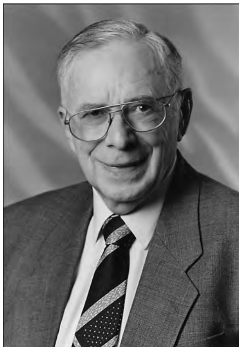
Hans Grauert in Bonn, 2000.

new construction of the completion of topological vector spaces [G10]; new proofs for the regularity of elliptic boundary value problems [G11]. In addition, the choice of topics, the choice between different options to build up and present a theory, shows Grauert's trademark: ex ungue leonem . The picture is completed by his monographs and textbooks on complex analysis [10], [13] in which many of his research results have found their place. So, Grauert would have had plenty of reason to mention himself in his lectures, but to my knowledge he never did it.