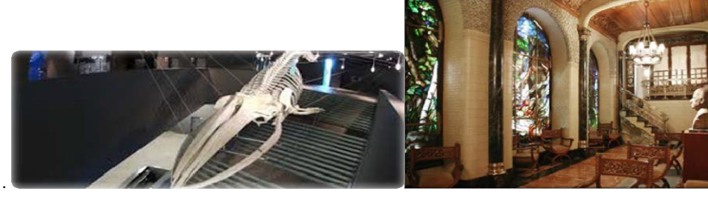
Visit to the CercledelLiceupinacotheque

The BHK-AEoffered a lunch in honour of the MAE and members of the YAE.