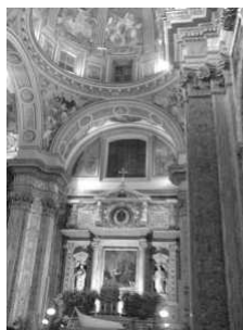
The church of SS Marcellino & Festo, Naples

A Gold medal will be awarded to the Compagnia di San Paolo (of Torino)