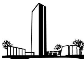
Logo of the Wenner Gren Founda- tion, Stockholm

The next symposium takes place 5th–7th November, in Stockholm