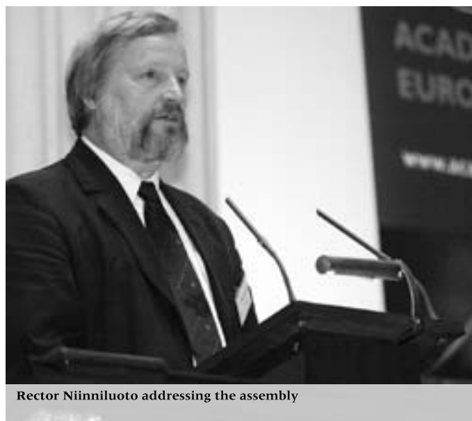
Rector Niiniluoto addressing the assembly