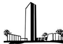
Logo of the Wenner Gren Foundation, Stockholm

The next workshop takes place 5th–7th November in Stockholm : "From Information to Knowledge: From Knowledge to Wisdom" - REGISTER NOW